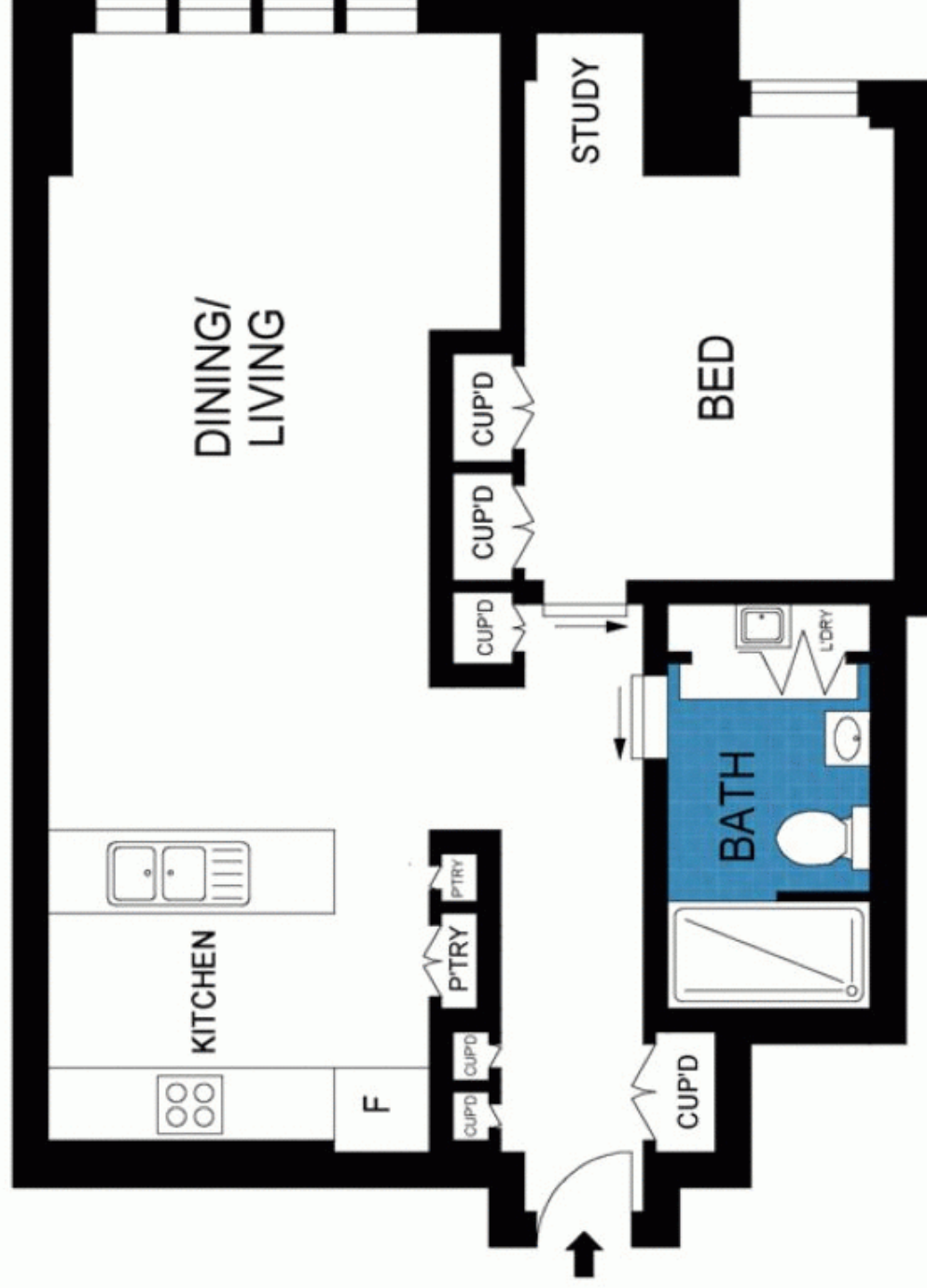
LEVEL TWENTY ONE