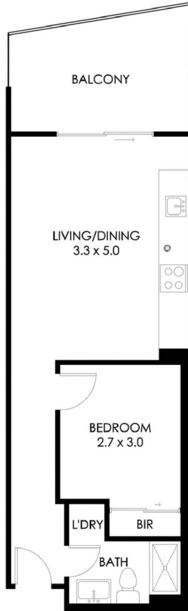
Floor Plan 1:50